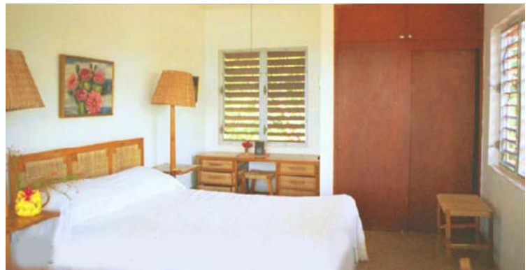
Above: Poinciana, the master bedroom. (Desk not visible, lower right). Below: The Allamanda Room (inside bedroom in west end)