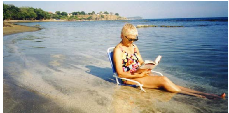
When the sea is calm, read at water's edge on a deserted beach. Below: From the dining area to the living room (the wide angle lens makes it look smaller than it really is). Game table under the window.