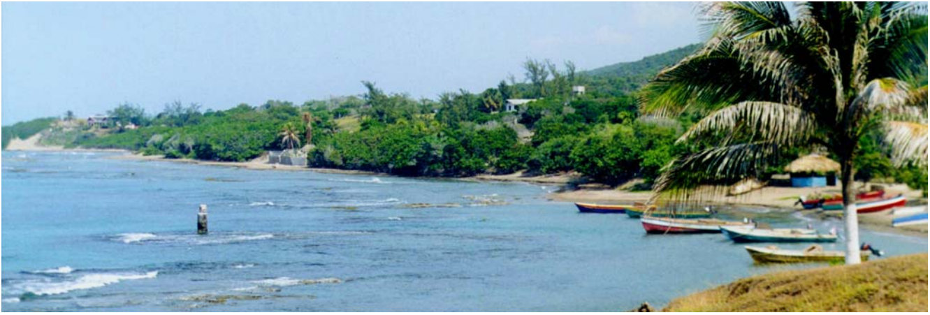
View west across the fishing cove. Hikaru peeks through the feathery casuarina trees above horizon; seagate, center-left

Our Hikaru Hints will offer suggestions for day trips if you tire of just loafing on the beach or terraces. There are several scenic points - the Bamboo Avenue; Lover's Leap; a panoramic view of the Pedro Plains - just a half-hour away. The Black River, also a half-hour away, is a spectacular marine morass you can visit by boat. Just beyond that is YS Falls, fully the rival of the better-known Dunn's River Falls. Mandeville, a pretty mountain city, is an hour and a quarter away, worth a trip for magnificent views, a glimpse of the bauxite (aluminum) industry, a colorful and superbly-stocked farmer's market, a good golf course, and some interesting restaurants. And the Negril resort area, seven miles of beach and pond-placid water with sailing and scuba diving, is a day trip to the west end of the island.