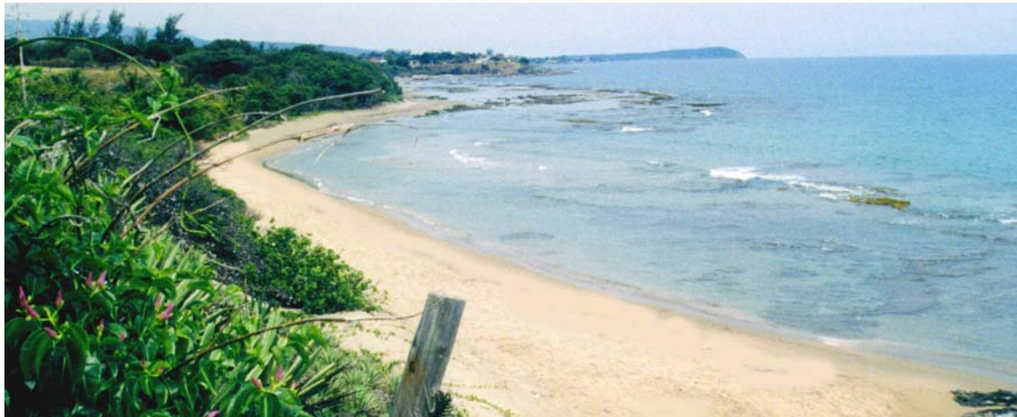
View east from the surfing beach. Feathery casuarinas above horizon, upper left, mark Hikaru.

And we encourage you to plan ahead. Most years we're occupied more than two-thirds of the year. Winter season usually fills up first, but even off-season months are sometimes booked well in advance. On the other hand, you may catch us with an open week on short notice; it's worth a phone call or e-mail.